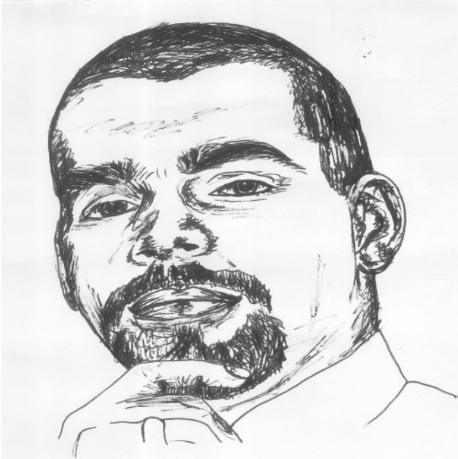
Honest bystander or criminal mastermind?